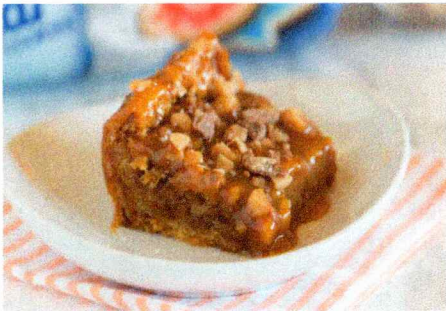
Salted Caramel Blondies