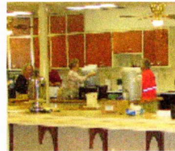
Apple Dumpling & Noodle Event