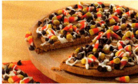
Candy Corn Cookie Pizza

This is a sweet and faBOOlously spooky dessert for you! Just 5 ingredients and 15 minutes of prep get you a yummy candy corn cookie pizza—a perfect family dessert or party offering. We opted for candy corn, chocolate chips or raisins, but you can top this sweet Halloween Cookie Pizza any way you like. - Pillsbury.com