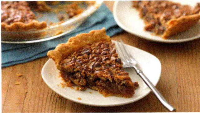
Salted Caramel Pecan Pie